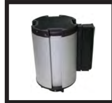
SC-EB Extensive Belt for Cone; 2m long