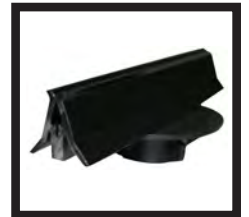
SC-HO Holder for Cone ( Sign not included ) hold 1 mm plate