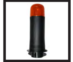
SC-FL Flash light for Cone ( battery not included ) 1 x UM-1 "D" battery